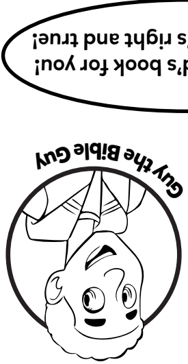
Guy the Bible Guy

The Bible is God's book for you! You can trust it's right and true!